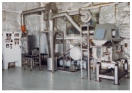
Carman Testing Laboratory

Your Carman Vibrating Fluid Bed Processor will be designed specifically for your application. With complete laboratory testing facilities, Carman can determine the exact size of equipment required to achieve your desired results.